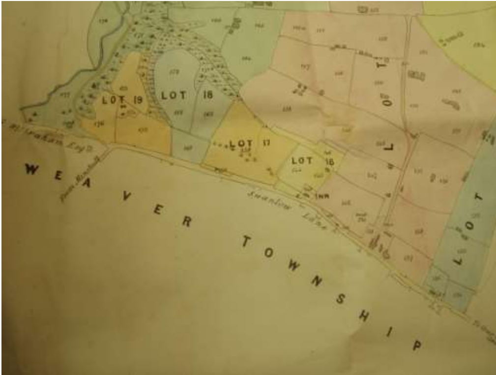
Part of the Darnhall Estate plan showing Lot 16 'The Raven'