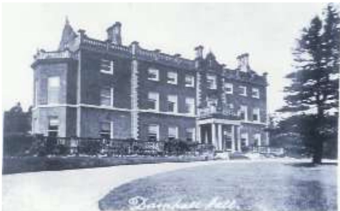
Darnhall Hall, circa 1900

In 1860 Edwin Corbett died and the estate was put up for auction at the Crewe Arms Hotel on 30 October. The basic description of the property was 'a freehold estate of upwards of 1700 acres' and 'comprehending a fine old baronial mansion'. It also included several dairy farms, tenements and cottages, a water corn-mill, streams and ponds, parkland, woodland plantations and 'a highly respectable tenantry'. Whether Edwin ever lived here for any length of time is doubtful: he was living in Rostherne in 1841 and ten years later he was living at Tilstone Fearnall.