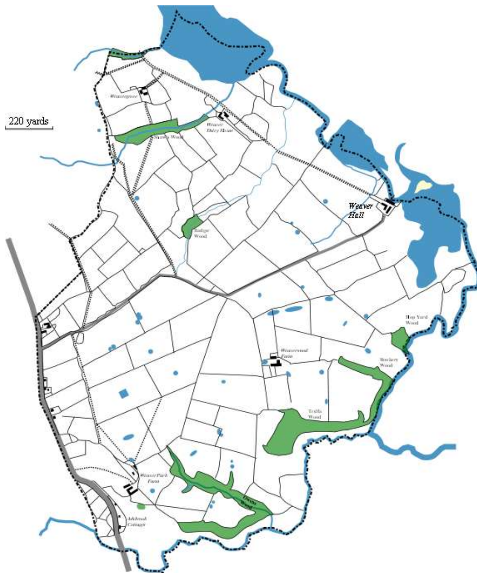
The Township of Weaver in the late 19 th century