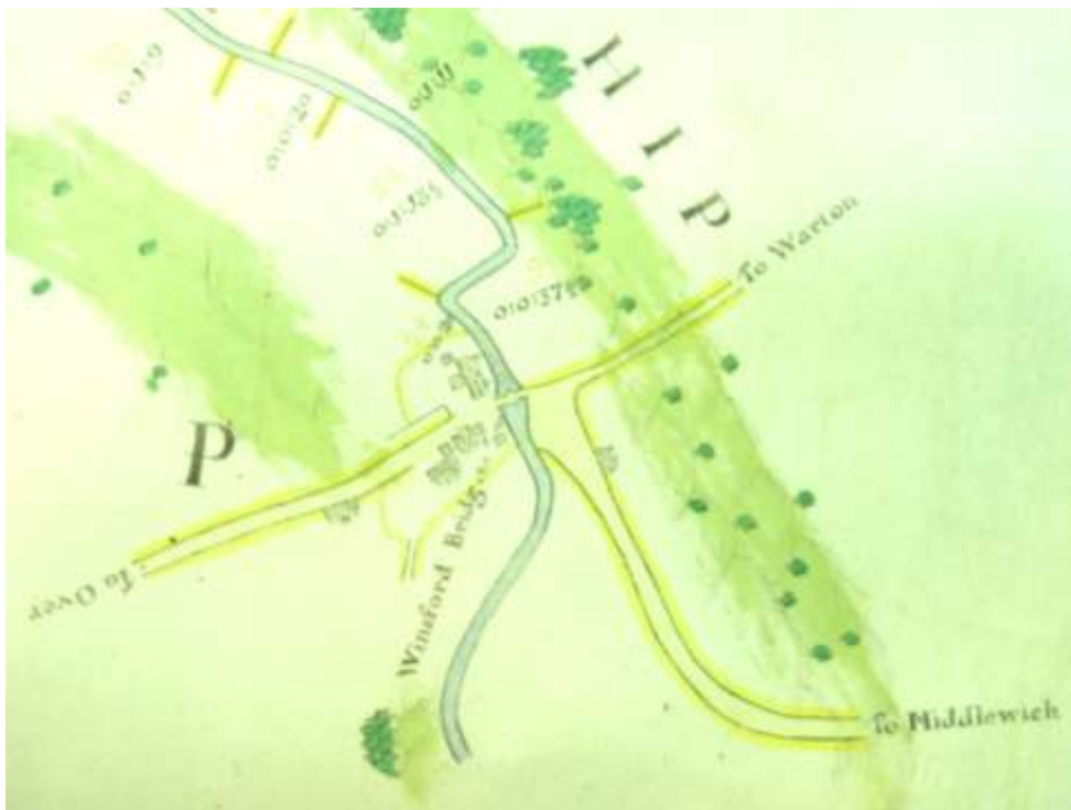
Figure One: Winsford in the 1720s (a detail from the map of the Weaver Navigation)

Above Stocks Stairs is the area is known as Ways Green a place-name that suggests a junction of routes. From here those who had crossed the river travelling west could take the road through Swanlow towards Nantwich; towards Wales, along Welsh Lane; follow the old Roman road towards Chester; or turn north to follow the line of the river.